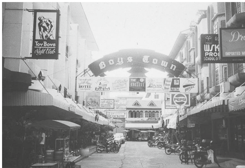
Illustration 11.2 The tourist resort during the day in the part of town catering to gay male sex tourists.

The rest of this chapter therefore will look at the specific case of child prostitutes in Thailand. Picking up on some of the previously discussed themes, it will discuss how children understood selling sex, how they differentiated what they did with their bodies from their own private morality, and the extent to which they located paid sexual activity as a form of child sexual abuse. It will also look at the clash of ideologies between children operating under one system of beliefs who come into conflict with the spread of global ideals of the importance of