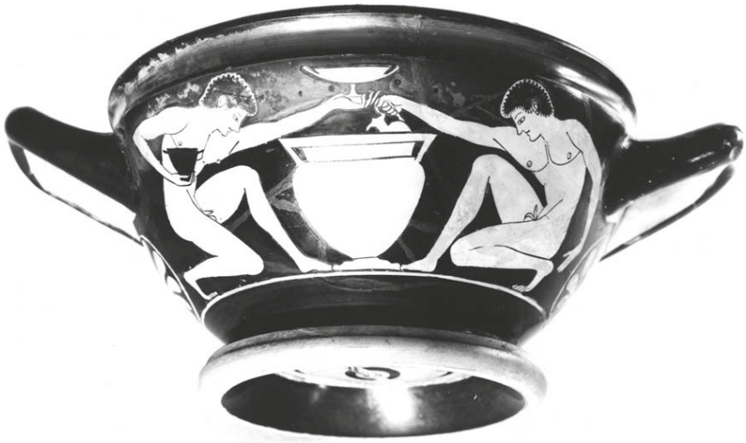
Illustration 2.1 An Attic red-figure cup, fifth-century BC, showing naked slave boys preparing to serve wine. Ashmolean AN G. 276.

among them. The trouble is that we are very badly informed even about the daily life of an adult slave, never mind that of an infant. Nonetheless, we get some glimpses. In a speech, for instance, the Athenian orator Lysias ( Against Simon : 3. 12–18; 32) described violent homosexual rivalry between Simon, portrayed as a drunken thug, and the defendant, owner of a Plataean boy, Theodotus – probably a slave – whom he himself courted ‘with affection’. Simon had been stalking the boy, had broken into the defendant’s house to look for him, had summoned the defendant from a dinner party to fight with him, and had finally ambushed and grabbed the boy in the street. The boy flung off his cloak and fled, taking refuge in a fuller’s shop, pursued by Simon and his men. He cried for help and a crowd gathered; the fuller and some others trying to protect the boy got beaten up; the brawl progressed down the street until the owner turned up unawares with his friends, whereupon Simon and his men let go of the boy and a violent fight ensued between the rivals, the boy pelting Simon’s men and defending himself and the rival men using fists and stones (Athenians carried no weapons), until they all got their heads broken and Theodotus’ owner took Simon to court.