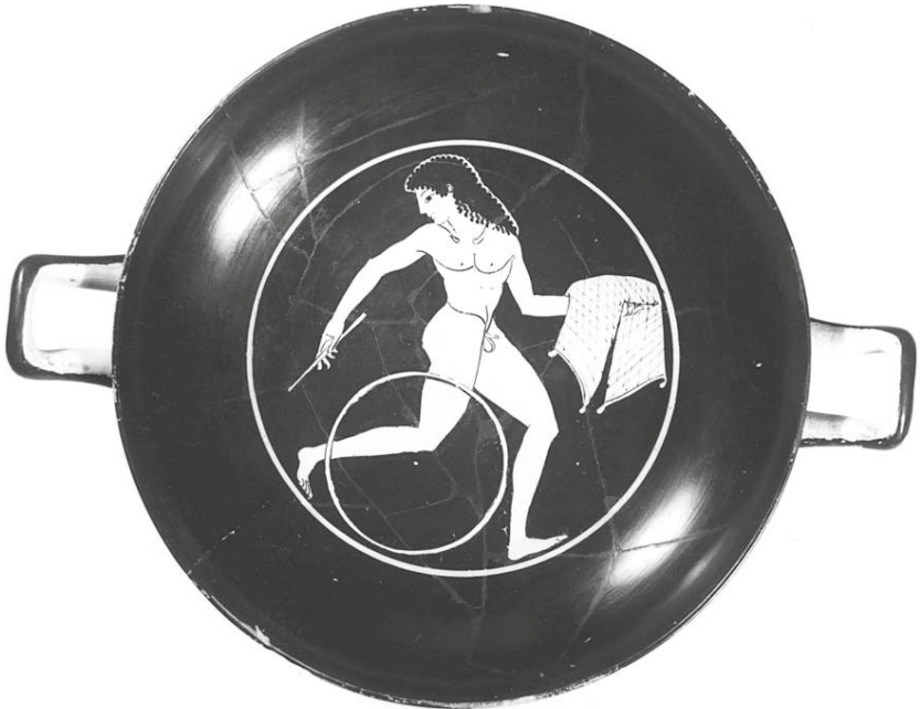
Illustration 2.2 An Attic red-figure cup, fifth-century BC, showing boy with a plate of food and bowling a hoop. Reproduced by kind permission of the Ashmolean Museum, University of Oxford. Ashmolean AN G. 276.

(those who had been enrolled soon after birth in the carefully guarded deme registers) could and could not do to one another. Despite a widespread view, partly based on a misunderstanding of what Athenians meant by eros , 9 pederasty in the present-day sense of actual sexual abuse of children was far from prevalent, and was indeed discouraged. Many Greek states, including Classical Athens, did, however, sanction, at least amongst aristocrats, mutually idealizing and sometimes passionate attachments between youths aged between the first hint of puberty (normally during the ages of 11 and 13 say) and fully bearded manhood (later teens), and a grown man who persuaded the boy of his choice to let him be his constant companion, role-model, and mentor, guiding his transition to independent manhood on the battlefield, at banquets, in public places, and, for all we know, also in brothels. Such partnerships could, within strictly prescribed limits, become sexually intimate, but boys were expected to be cautious and choosy in accepting a mentor, to be difficult to seduce, and in particular were supposed to refuse penetrative sex, which, if discovered, would disqualify them from citizenship.