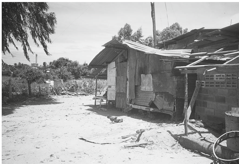
Illustration 11.4 Houses built without income from prostitution. Reproduced by kind permission of Heather Montgomery.