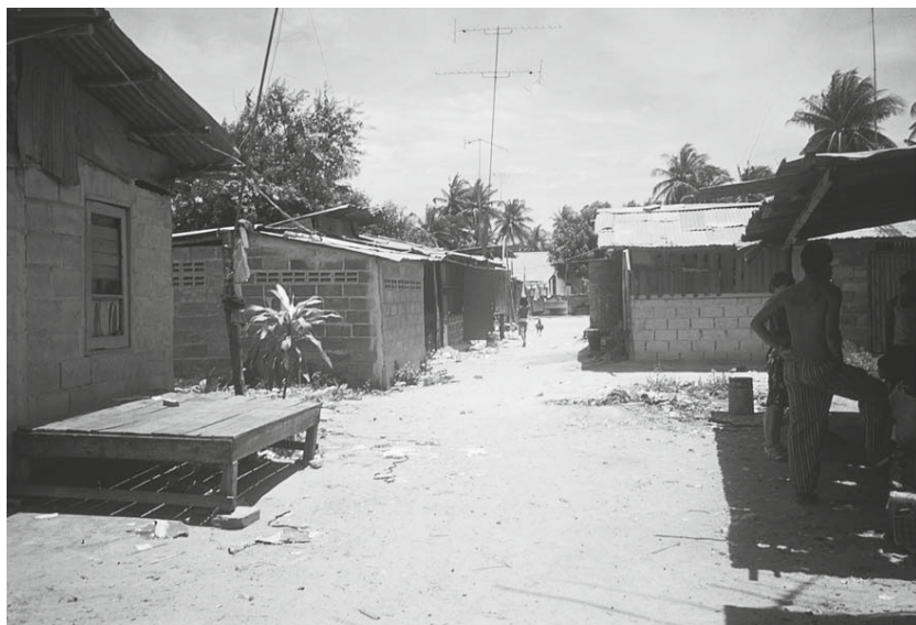
Illustration 11.3 The houses in the first picture have been rebuilt with income from prostitution. They are more substantial and better made than those in the second image that belong to families without working children.