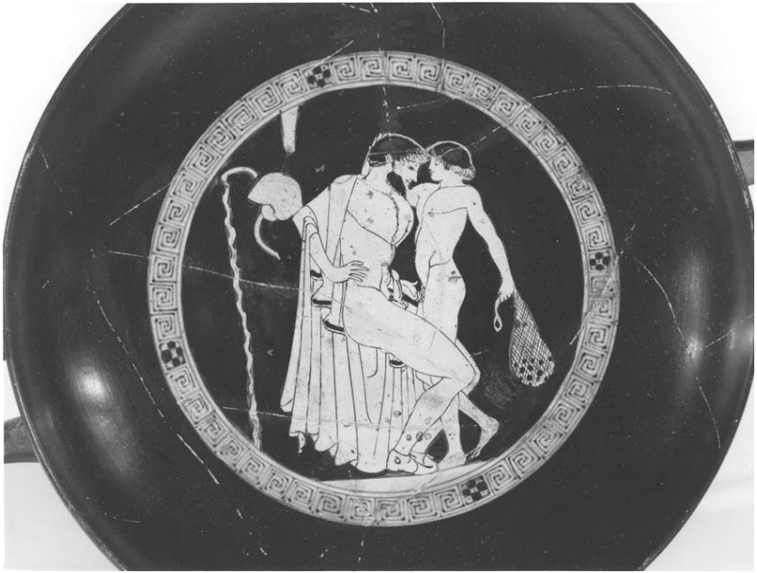
Illustration 2.3 An Attic red-figure cup, fifth century BC, showing a paedophile and his victim. Reproduced by kind permission of the Ashmolean Museum, University of Oxford. Ashmolean AN G. 276.

where one might have expected a certain tolerance for loose living, the ideal taught by Socrates was sophrosyne , or restraint and moderation. Socrates thus rebuked Critias, the future tyrant, for making a fool of himself over the youthful Euthydemus, pointing out to him that it was both demeaning and unseemly for a gentleman to beg for favours from someone he wanted to impress. Critias took no notice, and so Socrates said ‘in the presence of many others, “Critias seems to me to have the feelings of a pig, wanting to rub against Euthydemus as a pig rubs against stones”’ (Xenophon Memorabilia 1.2.29–30). Critias never forgave him. Much more pertinent to the question of child abuse is Socrates’ concern for the fatherless young Alcibiades who was so beset by admirers that he took steps to protect him (Plutarch Alcibiades 6).