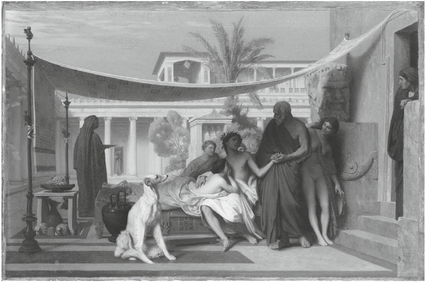
Illustration 2.4 Socrates seeking Alcibiades in the House of Aspasia by Jean Léon Gérôme (1861)

(a few years older than Alcibiades) and Paralus, who had reasons for disgruntlement other than the arrival of the little boys. Not only was their father repressive and stingy, but their mother left home, with Pericles' consent, to marry another man. In her place, apart from his numerous girlfriends, 29 Pericles introduced his fascinating and influential foreign mistress, Aspasia of Miletus, with whom he conducted an openly passionate relationship. Aspasia lived with Pericles from a date some time between 452 and 440 BC until his death in 429 30 and they had at least two children, including a son named Pericles; all four legitimate boys had many adjustments to make.