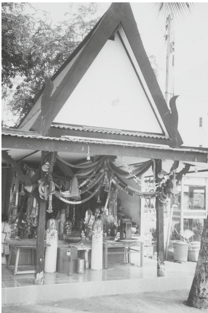
Illustration 11.1 The Shrine of the Penis. A small shrine in the tourist resort where the boys of Baan Nua would meet clients.

The important point here is not that these are primitive people with a 'freer' or less repressed attitude to sexuality than westerners, or that without these strictures, sexual abuse is unknown, but that appropriate sexual contact is differently defined depending on cultural context. While contemporary westerners may feel such overt sexual conversation